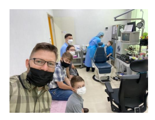
← Redistributing thousands of Gospel tracts Covid-test →