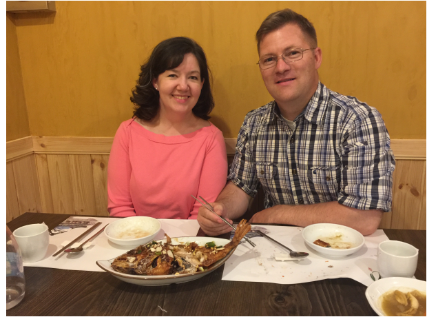
Wonderful couples banquet. Very much a help as always!!