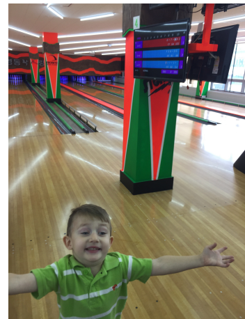
Pro bowler... maybe not yet→