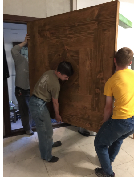
We made a farmhouse style table out of a repurposed 80-year-old Buddhist Pagoda.