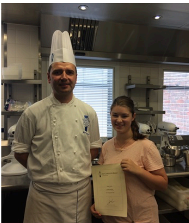
Cordon Blue Cooking School.