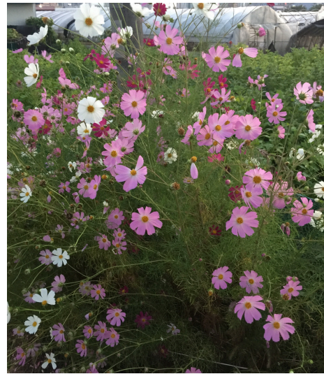
Beautiful yearly cosmos.