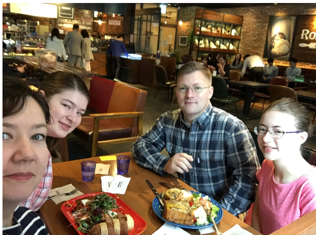
← Graciously gifted a night at the Marriott Hotel with a great meal.