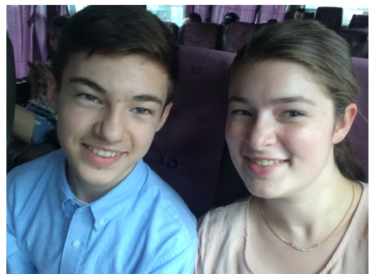
Million Dollar smiles, almost... Braces finally off →