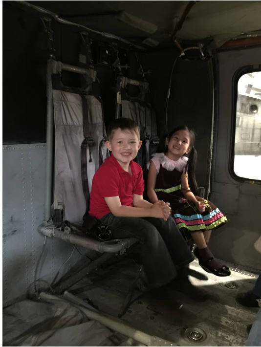
Trip to the local Army Post!!