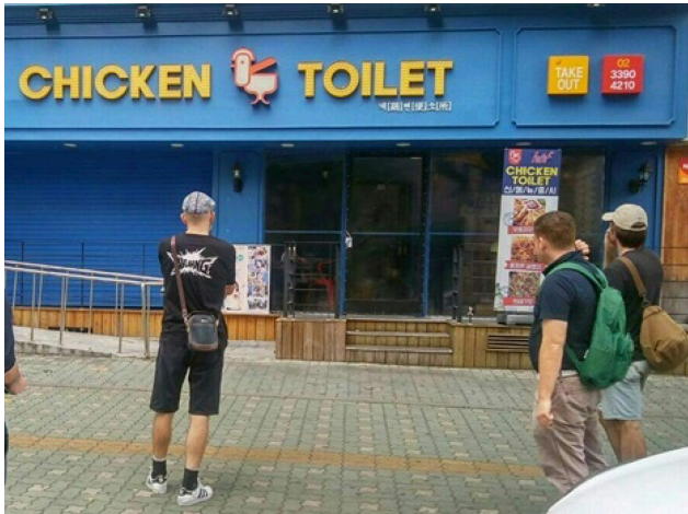
Not our favorite place to eat??