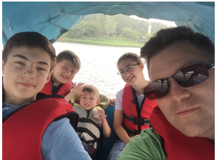
Children's Day swan boat ride