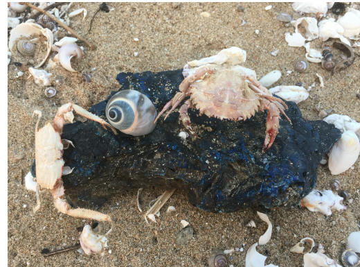
Interesting creatures my wife and I found during our walk in the beach.