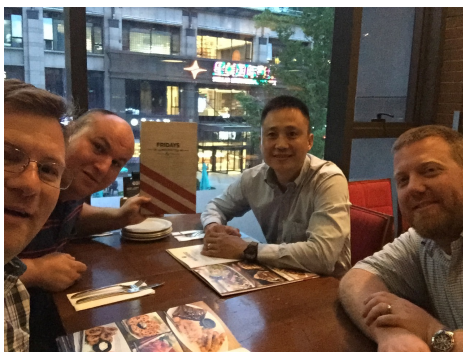
Missionary meal... Just a great time with God's servants