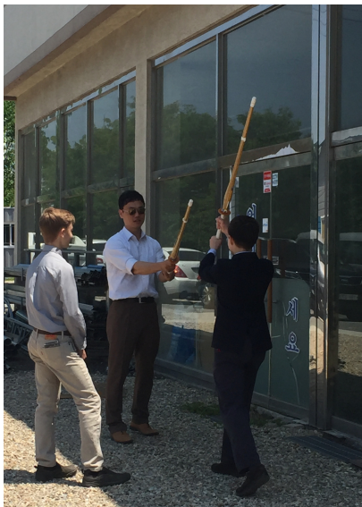
← Korean kumdo lessons from the Neurologist in our church.