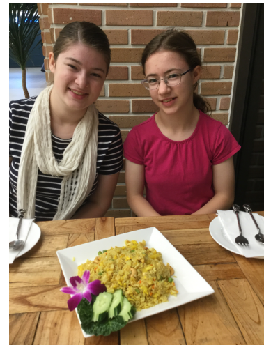
Sister time over a little Thai food.