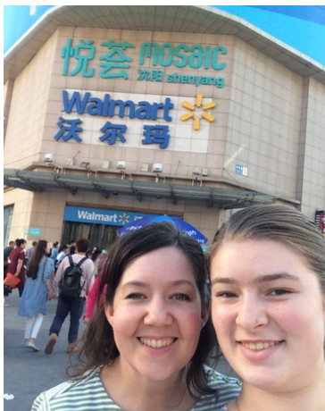
← Comforts of home??????