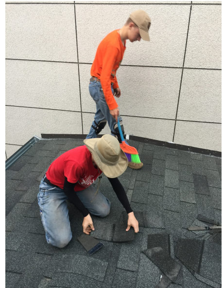
Small roofing job→